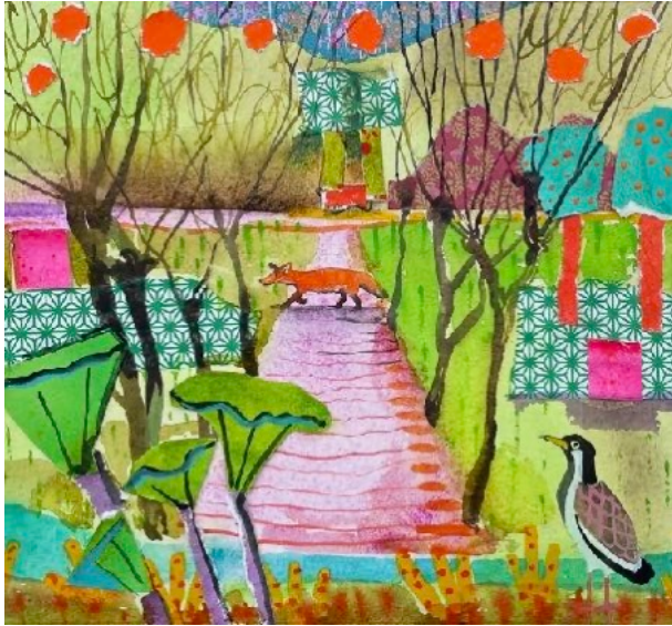
The Secret Garden Watercolour & collage 10.5 x 11.5 inches £1,400