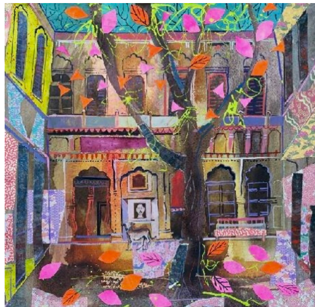
Echoes in the Inner Courtyard