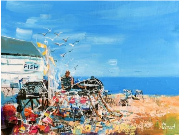
Deal Beach Mixed media 12 x 16 inches £1,400