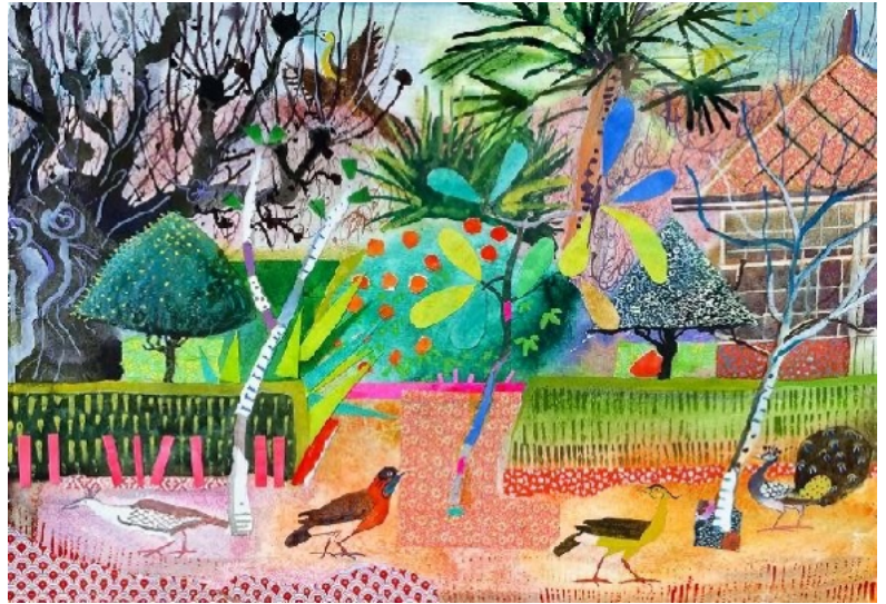
Topiary at the Potager Watercolour & collage 22 x 31 inches £4,200