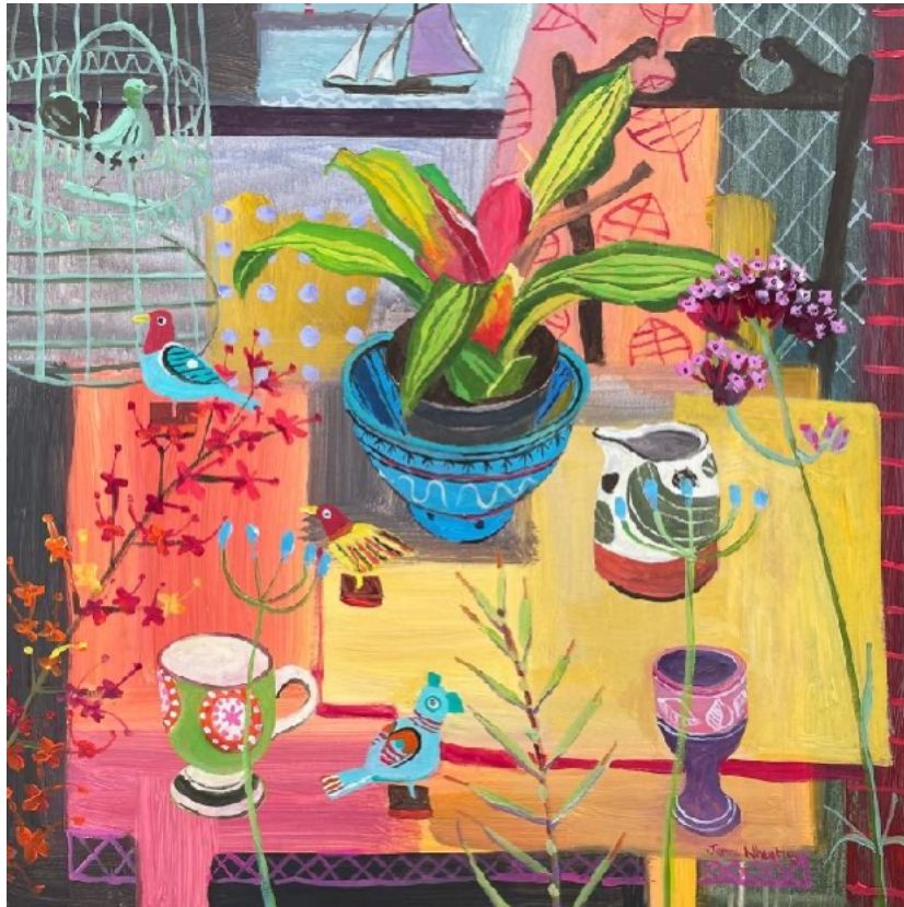
Front Cover: Mike Bernard Sailboats, Salcombe Harbour Mixed media 27.5 x 35.5 inches £5,200