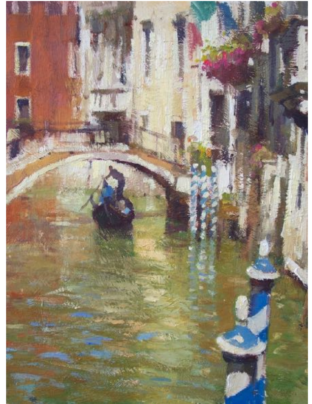
3. Gondola Oil on board 16 x 12 inches £2,850

It feels especially fitting to present this exhibition in Canterbury, in the heart of the Garden of England, the very county that has so profoundly shaped his work. Here, surrounded by the landscapes, estuaries and expansive skies that continue to inspire him.