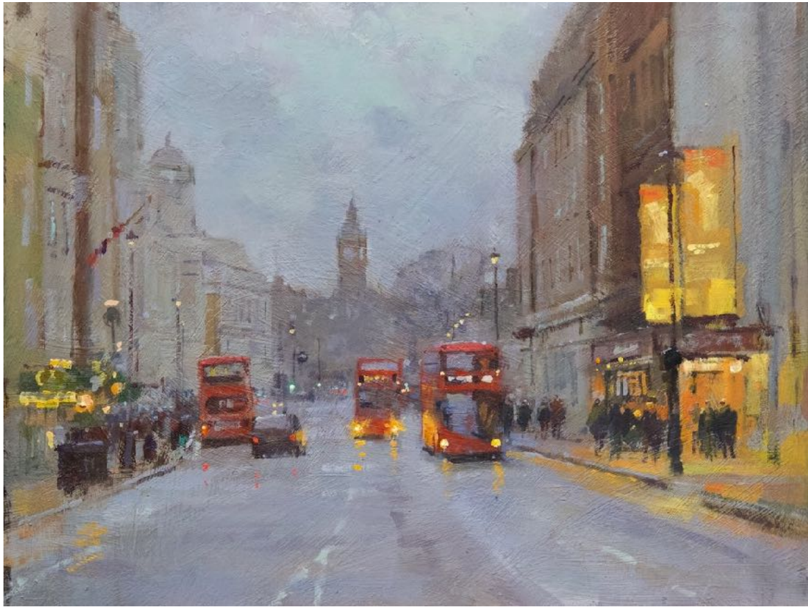
27. Evening Lights in Whitehall Oil on board 9 x 12 inches £1,850