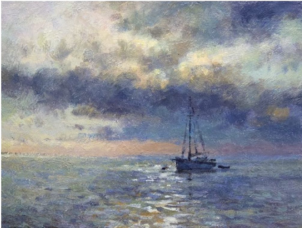
7. Silver Light on the Swale Oil on canvas 12 x 16 inches £2,850