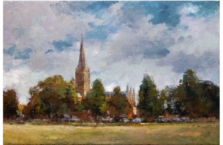
20. Salisbury from the Close Oil on canvas 8 x 12 inches £1,850