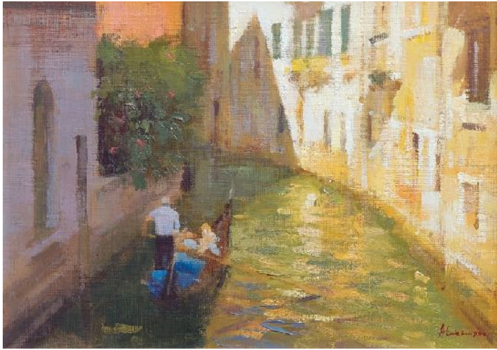
5. Backwater Canal, Venice Oil on board 7 x 10 inches £1,450