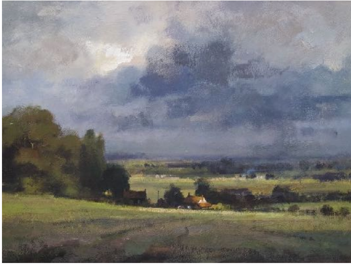
9. Passing Storm at Marshside Oil on board 15 x 20 inches £5,850