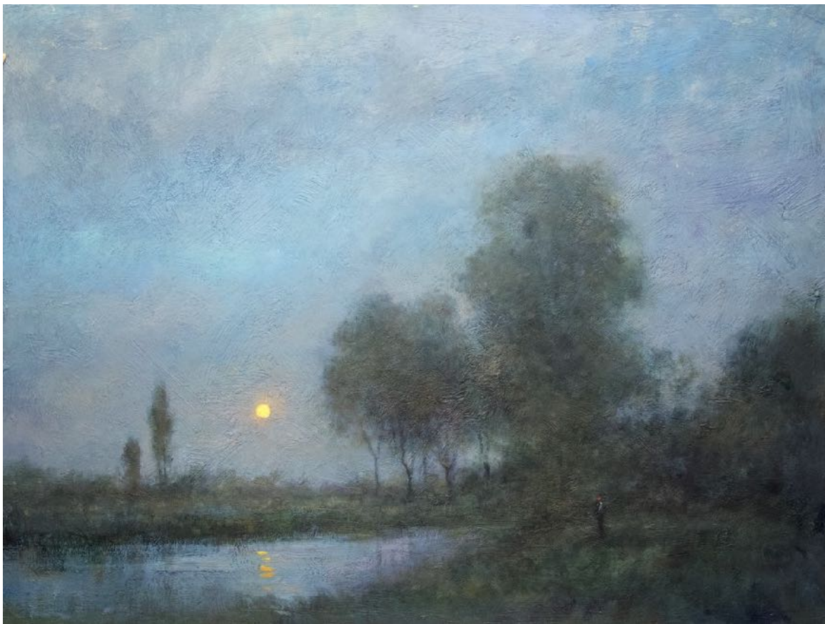
13. Harvest Moon Oil on canvas 18 x 24 inches £6,850