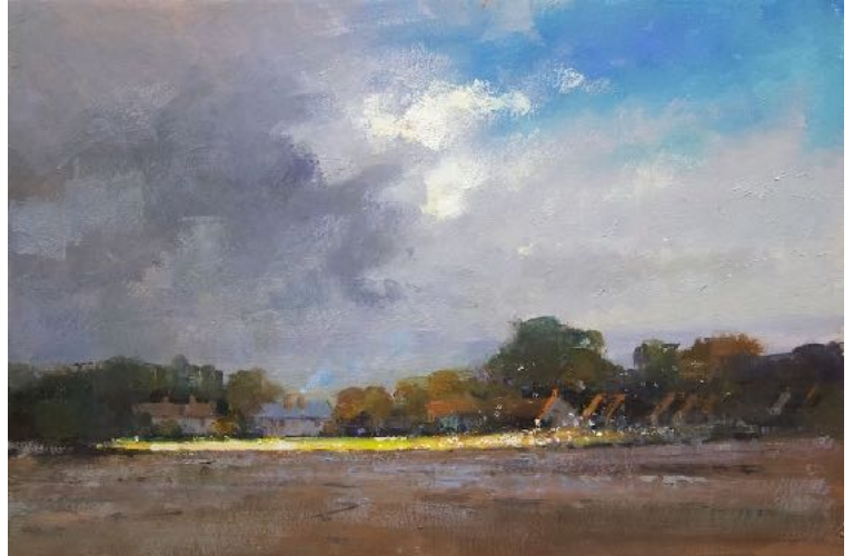
10. Approaching Storm, Monkton Oil on board 8 x 12 inches £1,850