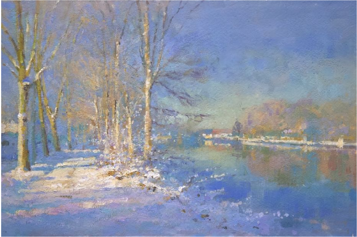
22. Snow at Bougival, France Oil on board 8 x 12 inches £1,850