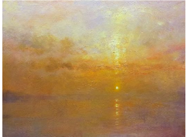
17. Golden Hour on the Swale Oil on board 12 x 16 inches £2,850