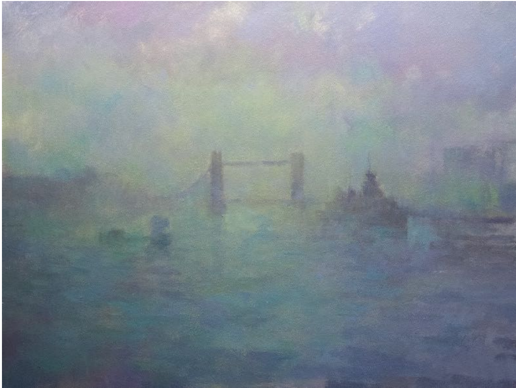
25. Misty Morning at Tower Bridge Oil on canvas 18 x 24 inches £6,850