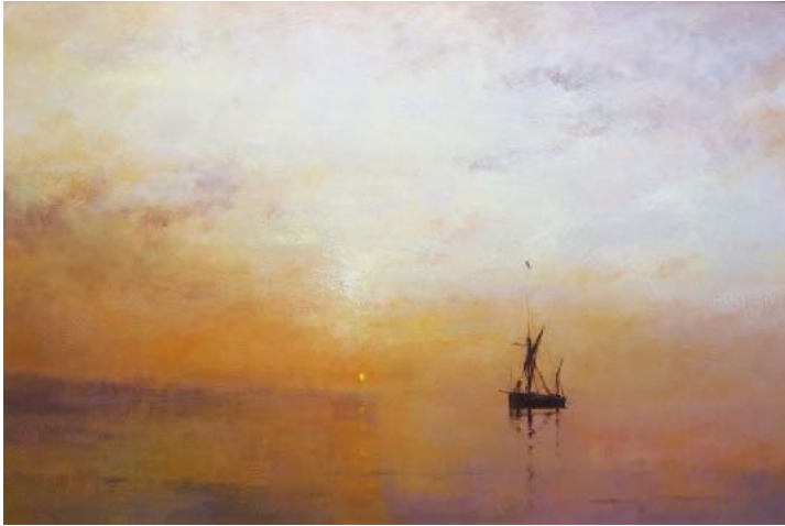
16. A Quiet Anchorage Oil on canvas 24 x 36 inches £12,850