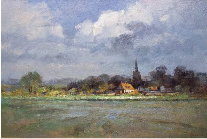
19. Wingham from the Fields Oil on board 16 x 24 inches £4,250