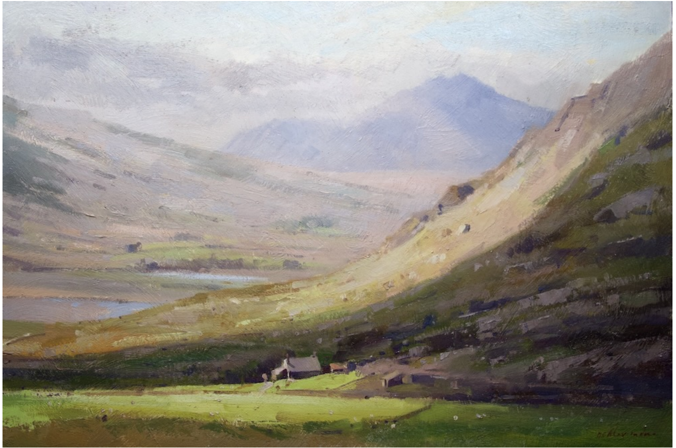
8. Snowdonia Oil on board 20 x 30 inches £9,850