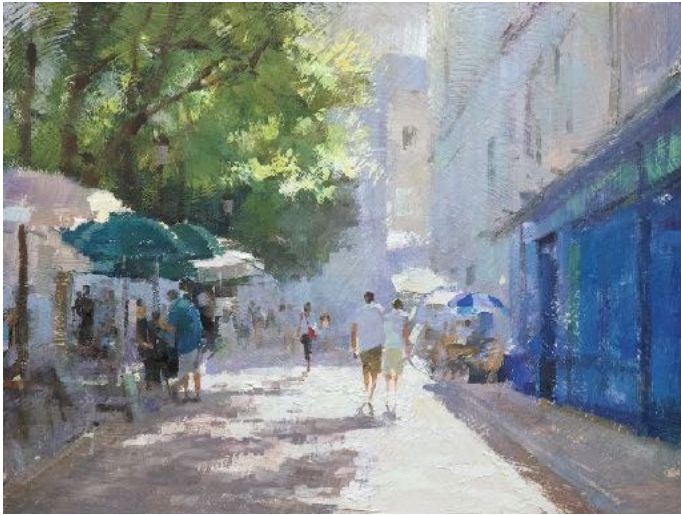
23. Summer Sun, Place Du Tertre, Paris Oil on board 9 x 12 inches £1,850