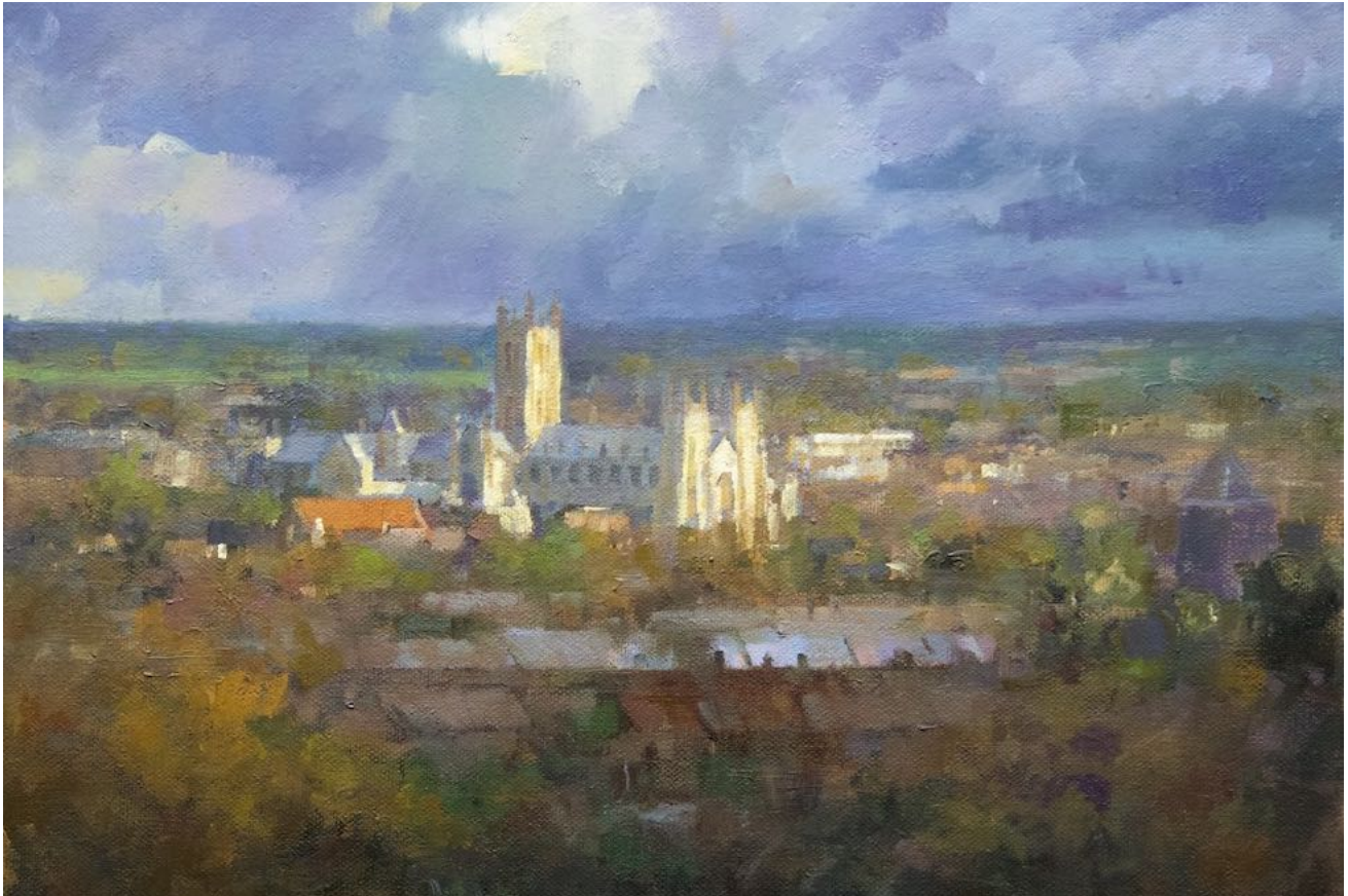
26. Canterbury Cathedral Oil on canvas 12 x 16 inches £2,850