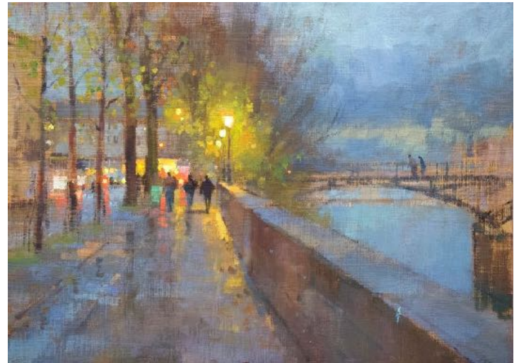
24. Evening at Le Ponte Des Artes Oil on board 10 x 14 inches £2,250