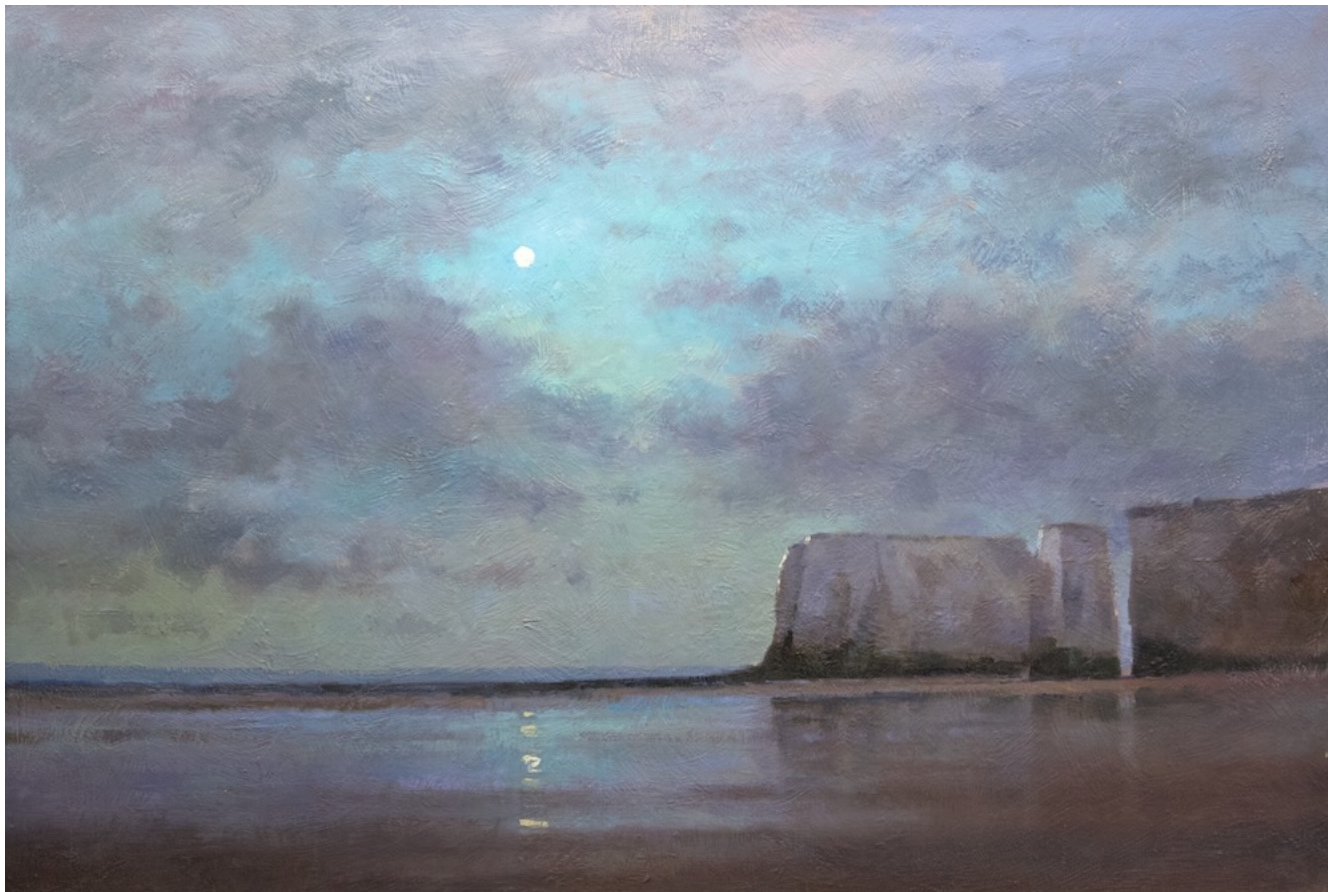
4. Moonlight at Botany Bay Oil on board 20 x 30 inches £9,850