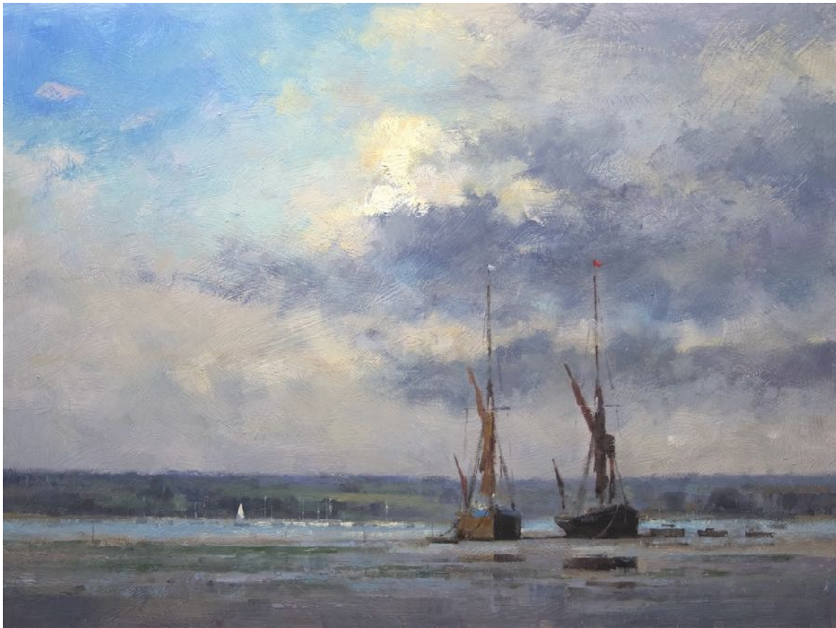
18. Beached Thames Barges at Pin Mill Oil on board 18 x 24 inches £6,850