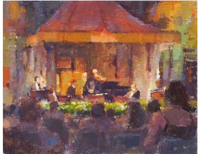
6. Evening at Florians, Venice Oil on board 8 x 10 inches £1,450