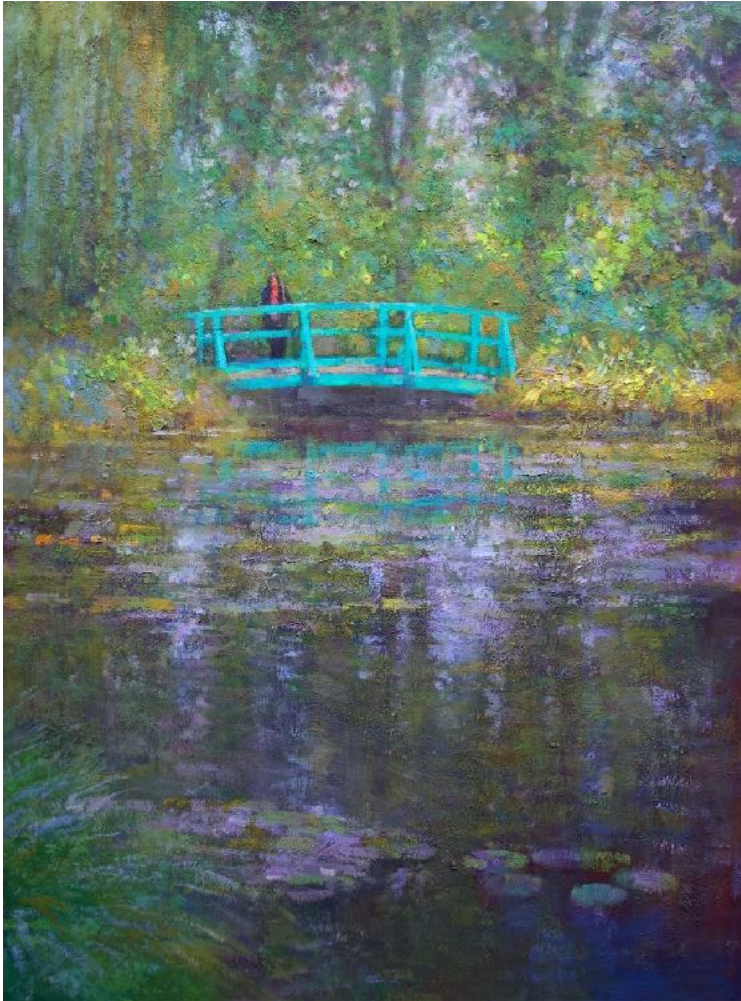
21. On the Bridge at Giverny Oil on board 24 x 18 inches £6,850