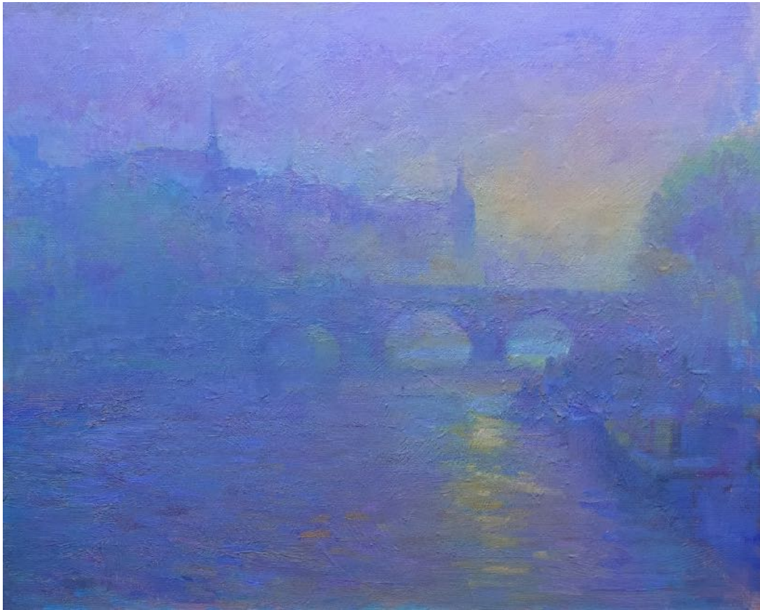
14. Fog on the Seine, Paris Oil on canvas 16 x 20 inches £5,850