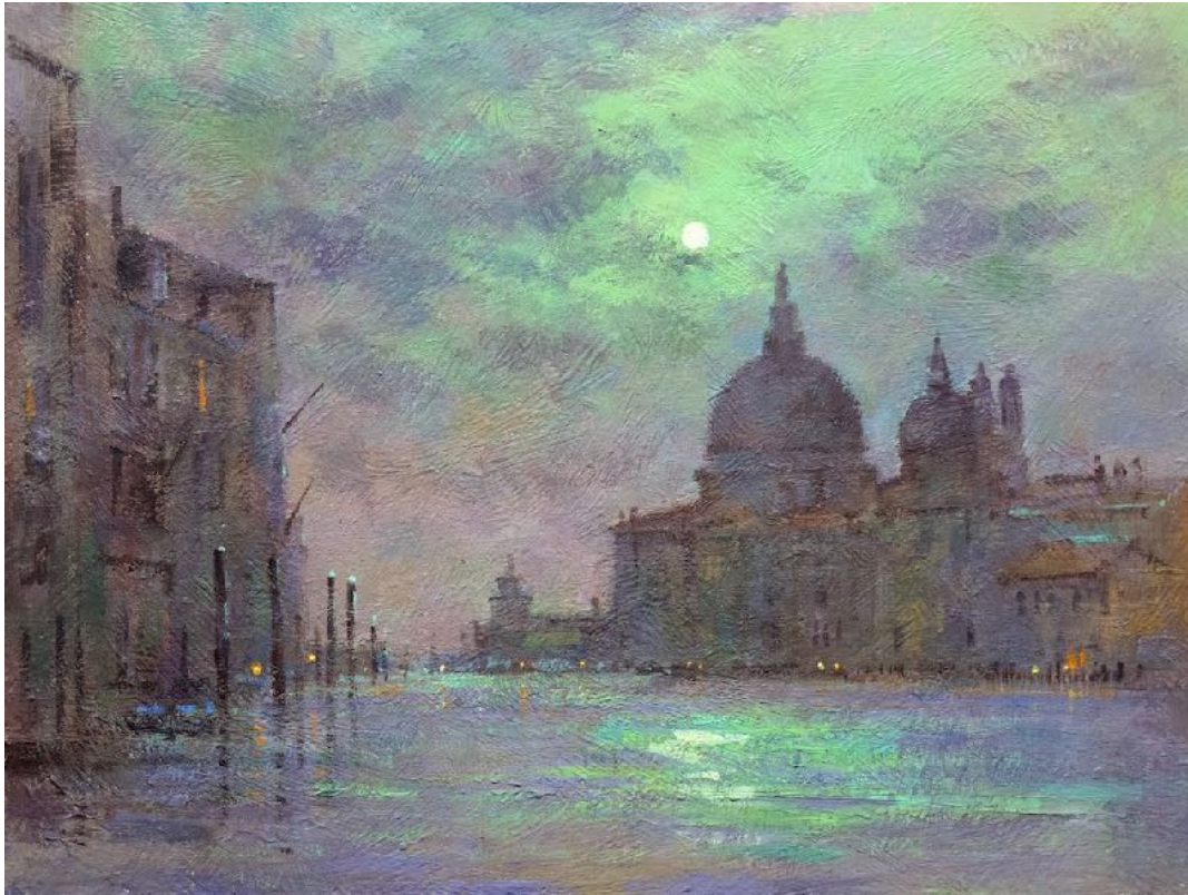
15. Full Moon on the Grand Canal, Venice Oil on board 12 x 16 inches £2,850