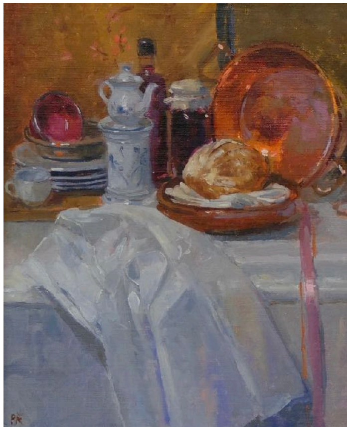
Still Life with Copper Pan