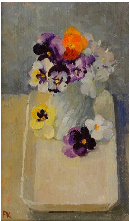
Violas on a Small Tray