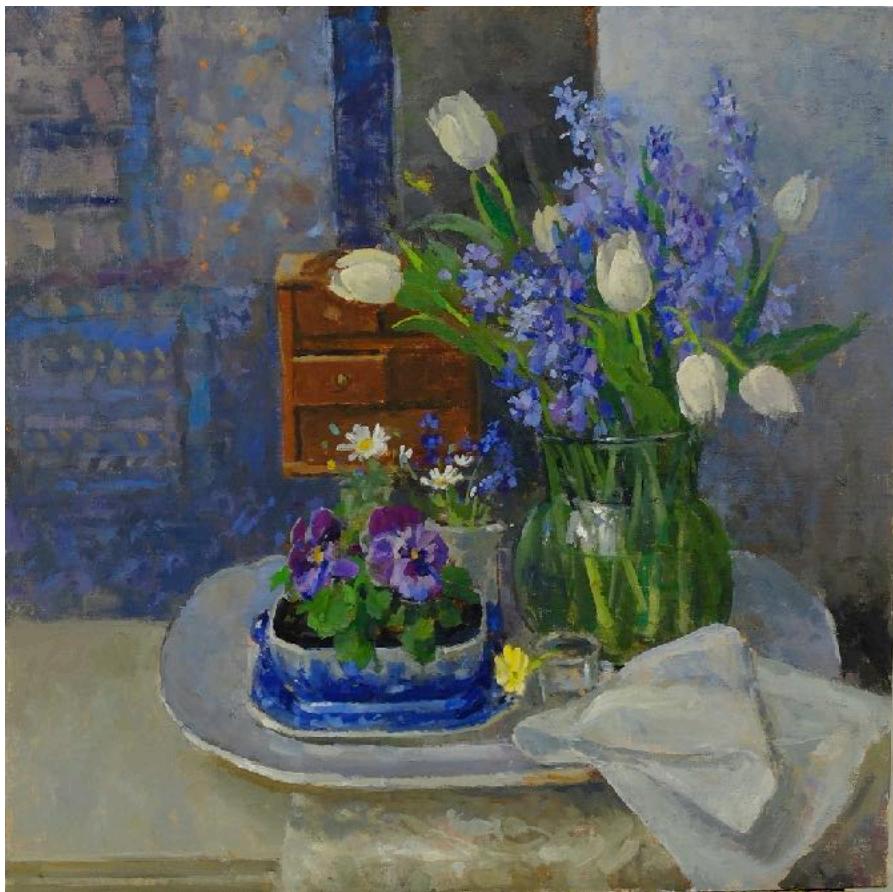
Still Life with Bluebells and Tulips