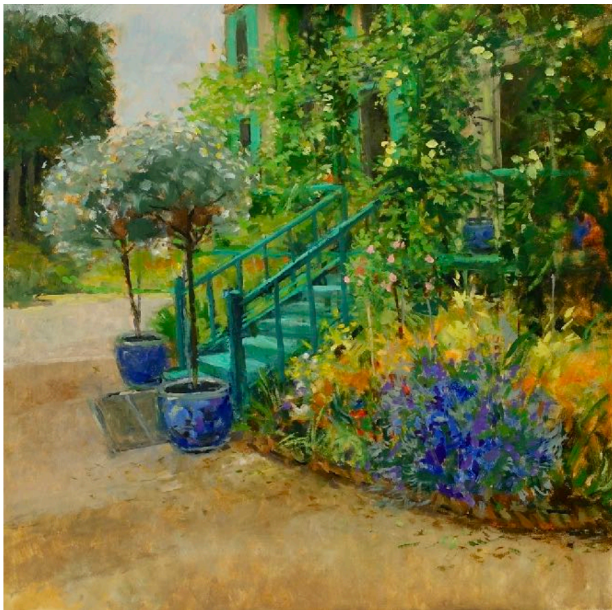
By the House, Giverny Oil on board, 24 x 24 ins £3,750