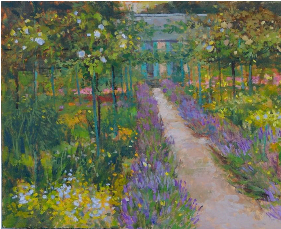
Butterflies in the Lavender Walk