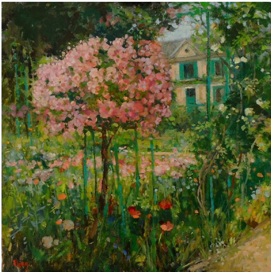
Front Cover: Table Still Life with Bread and Gerberas (Detail)