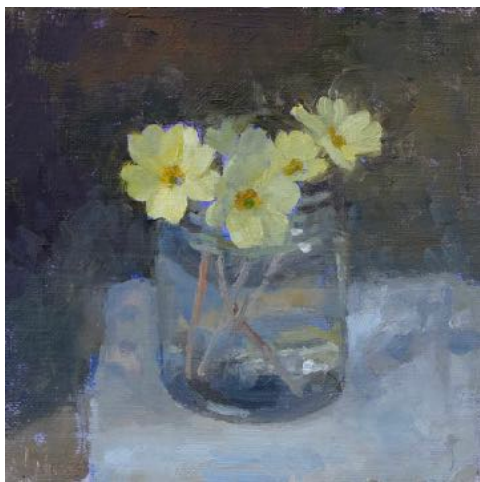
Primroses in a Jam Jar