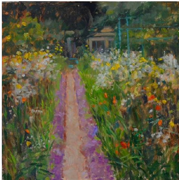
The Garden, Giverny