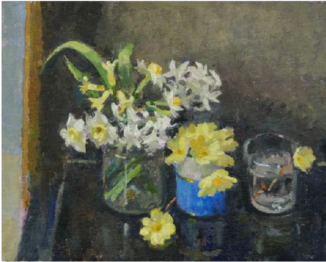
Spring Flowers on the Lacquer Tray