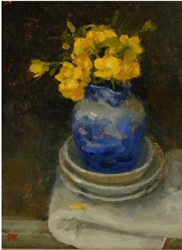
Buttercups in the Spode Jug