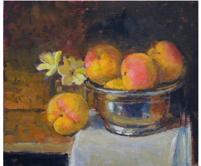
Apricots in a Silver Dish