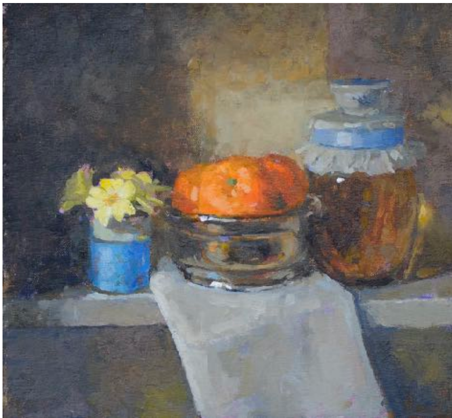
Primroses, Clementines and Honey on a Shelf