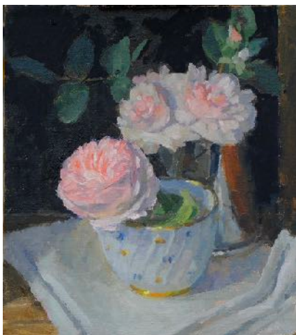
Cup and a Silver Jug of Roses