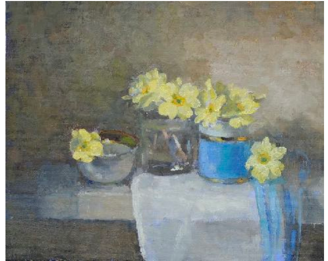
Primroses on a Shelf