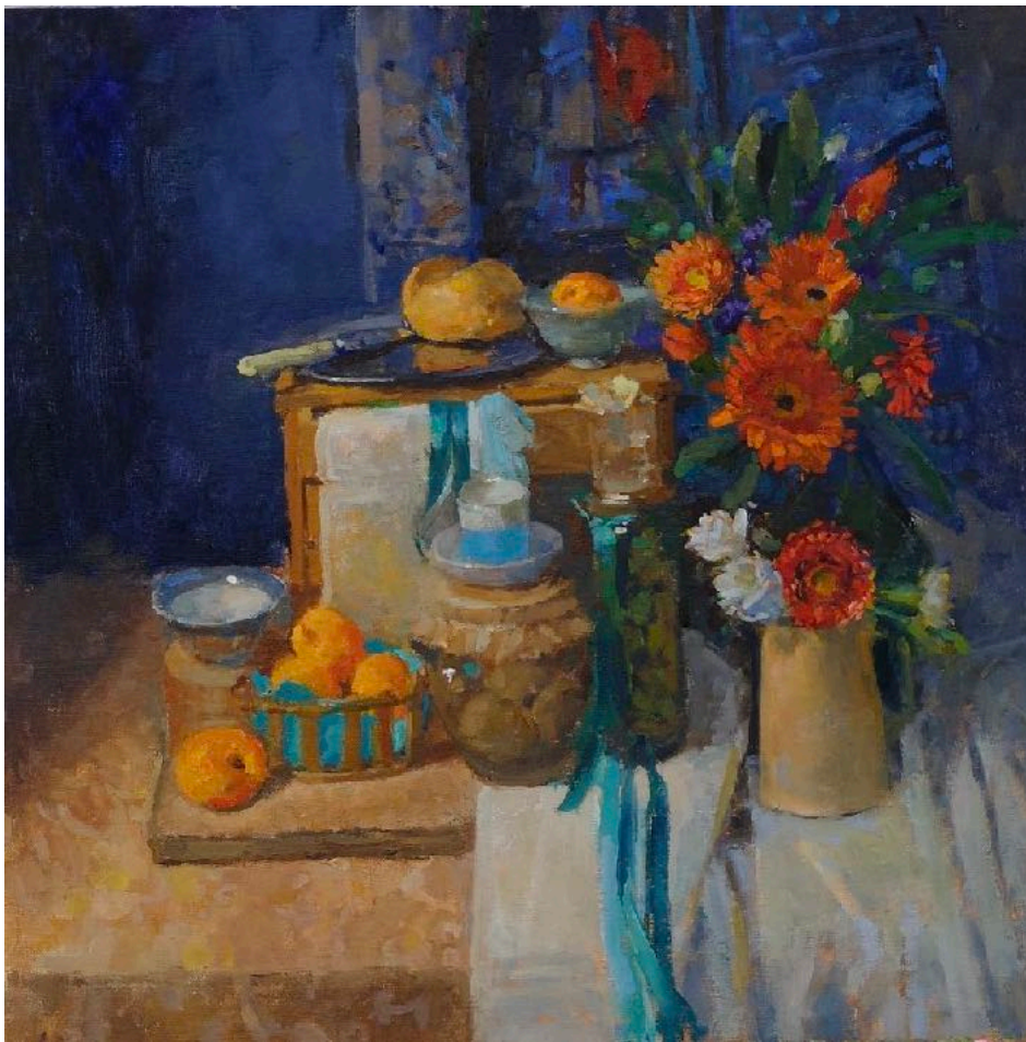
Table Still Life with Bread and Apricots