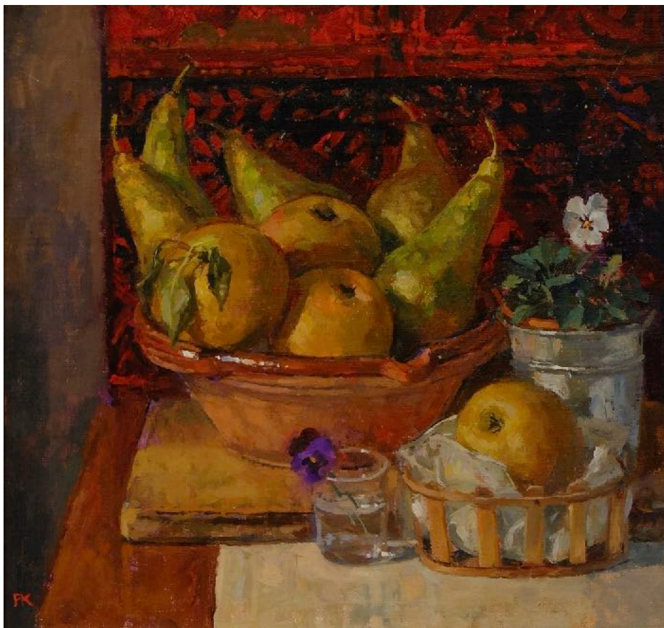
Still Life. Pears and Russet Apples