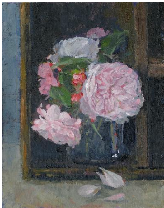
Rose Fantin-Latour in a Glass