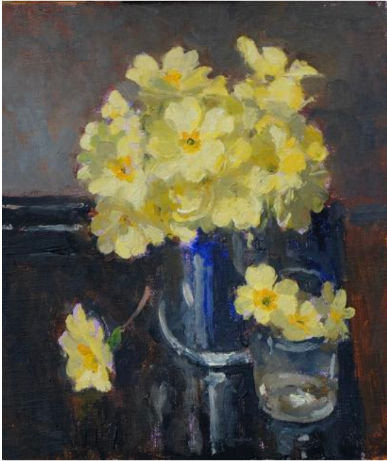
Silver Jug of Primroses Oil on board, 8 x 7 ins £975

For more than five decades, Pamela Kay has enchanted audiences with her exquisite still lifes and delicate watercolours. Renowned for her keen eye for detail and masterful use of light and colour, her paintings capture the quiet beauty of everyday objects and scenes, inviting viewers into a world of tranquillity and contemplation. Pamela's oeuvre is defined by her focus on still life, florals and interiors. Flowers, fruits and ceramics are often arranged with harmonious balance, rendered with meticulous draftsmanship and sensitivity to texture and form. Light is central to her practice, subtle shifts of shadow and highlight create depth and luminosity, while her palette of soft muted tones enhances the quiet elegance of her compositions.