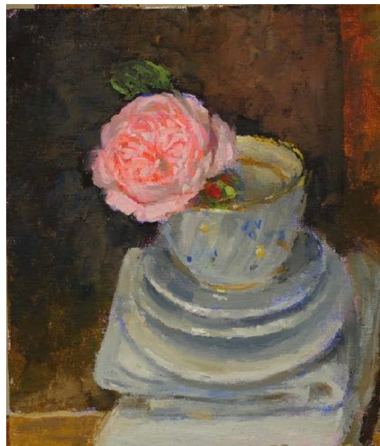
Rose in a Cup