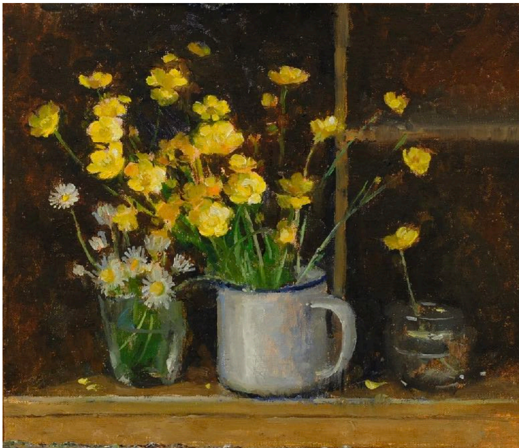
Buttercups in a Mug and Daisies