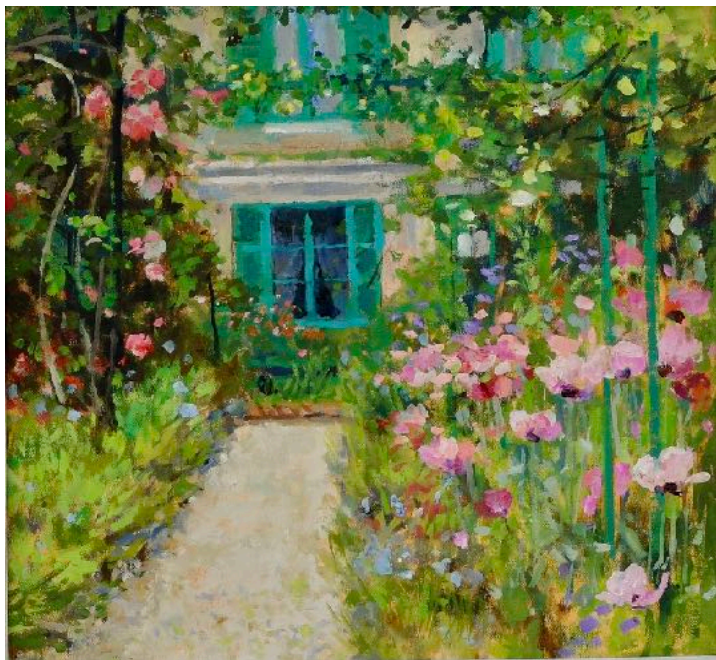
Roses and Poppies in the Lavender Walk