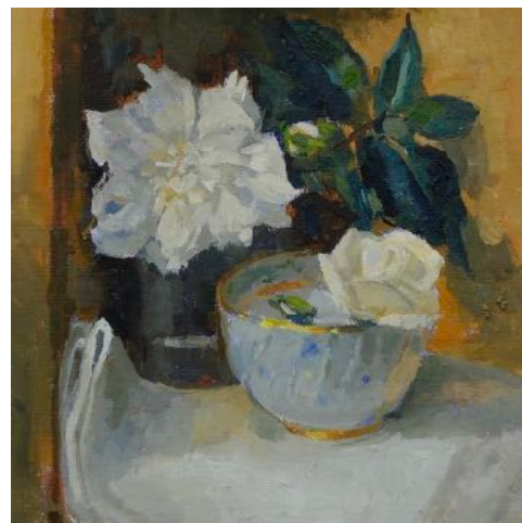
Two Roses on a Shelf