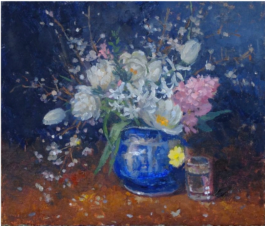
Spring Flowers in the Spode Jug