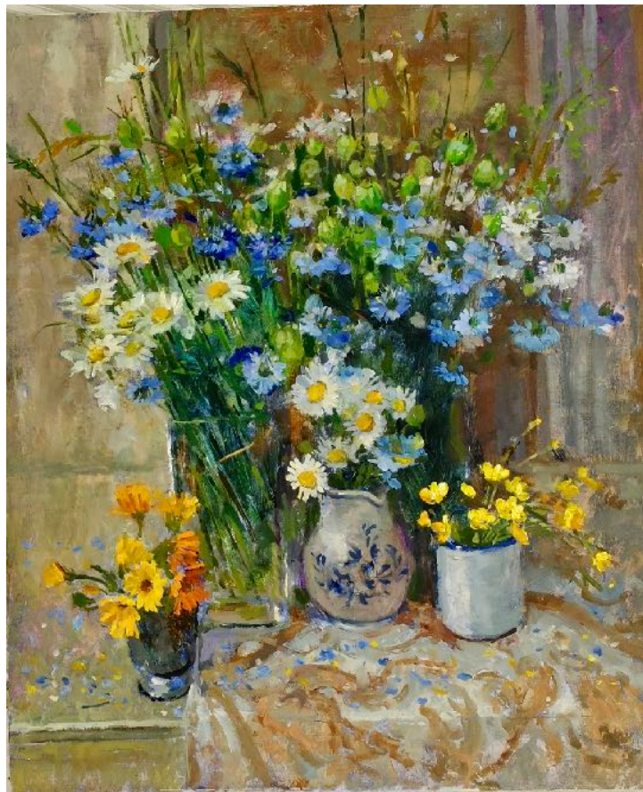
Nigella, Daisies, Marigolds and Buttercups