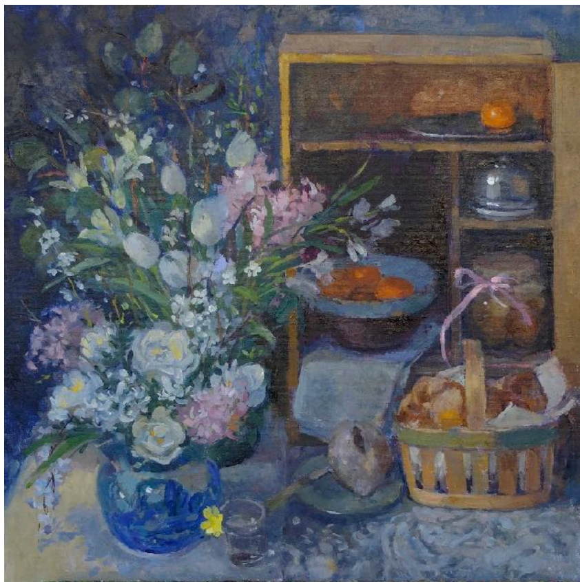
Cupboard Still Life with Spring Flowers