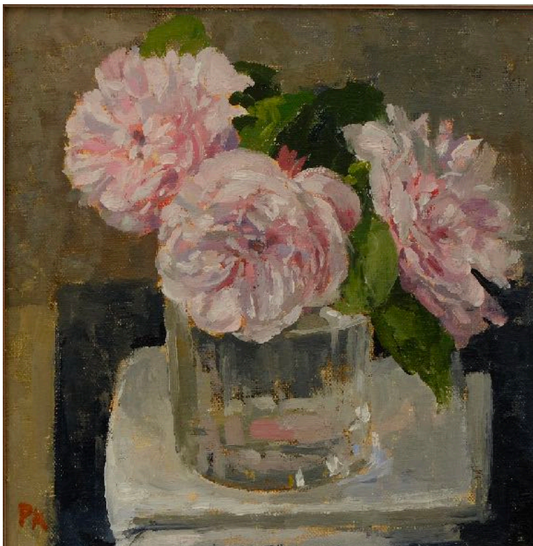
Three Roses in a Glass Oil on board, 7 x 7 ins £950