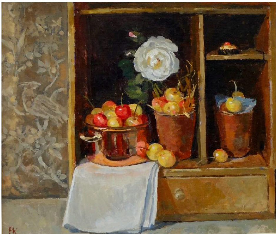
Small Cupboard with Cherries