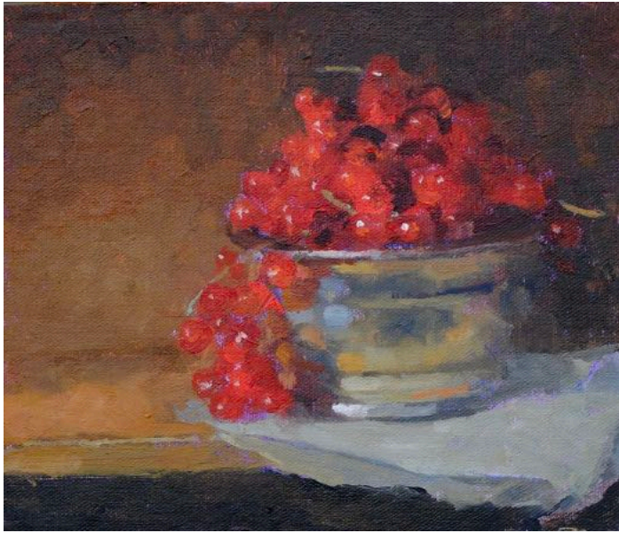
Redcurrants in a Silver Dish